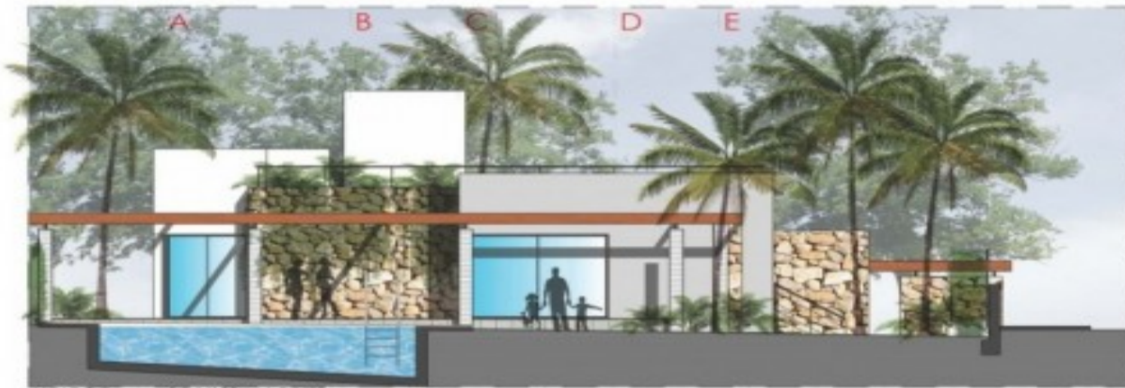
ALZADO B A3 E:1/100 - A1 E:1/50