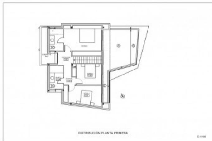
DISTRIBUCIÓN PLANTA PRIMERA