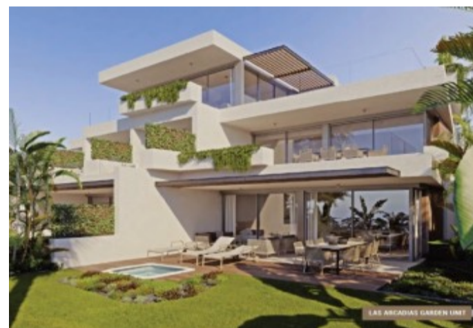
LAS ARCADIAS GARDEN UNIT