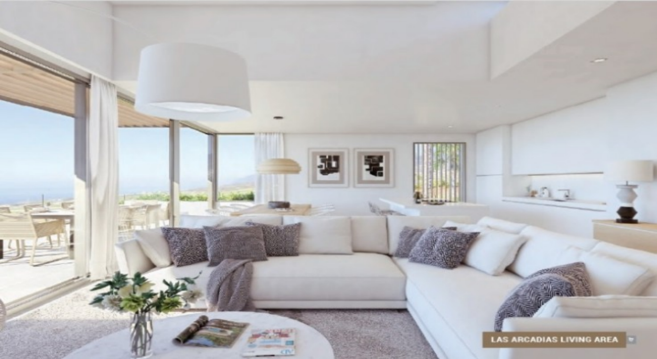
LAS ARCADIAS LIVING AREA