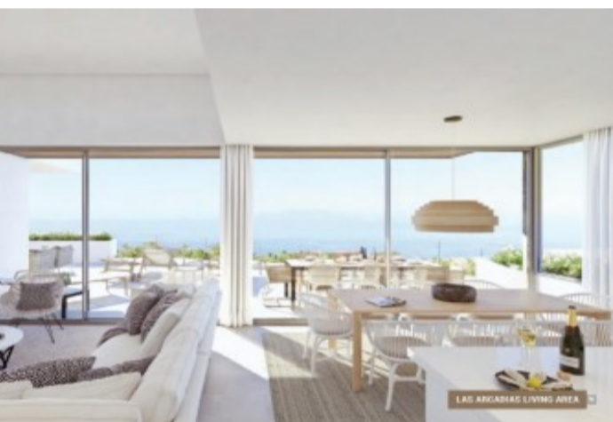
LAS ARCADIAS LIVING AREA