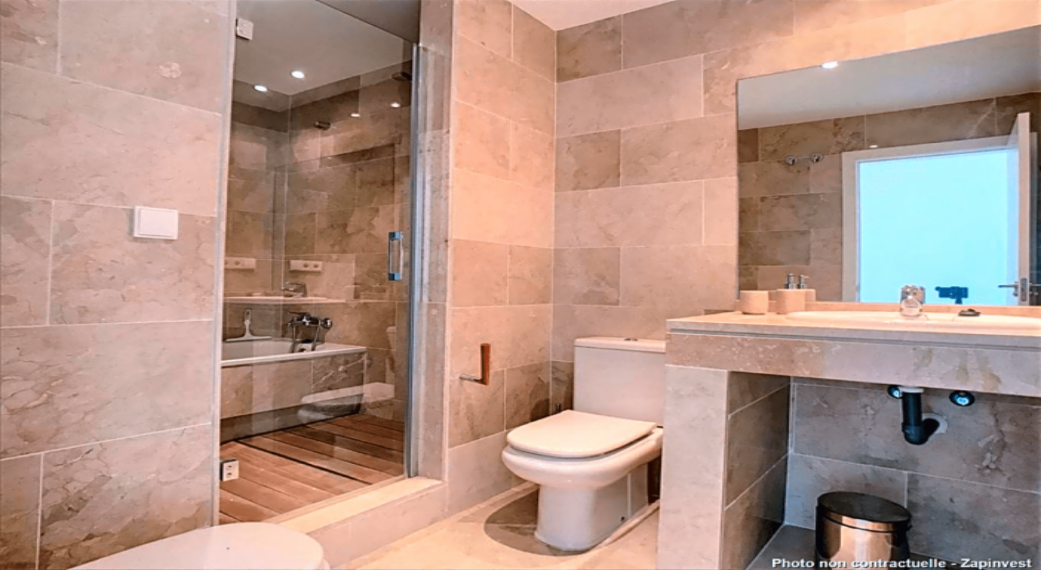
Photo non contractuelle